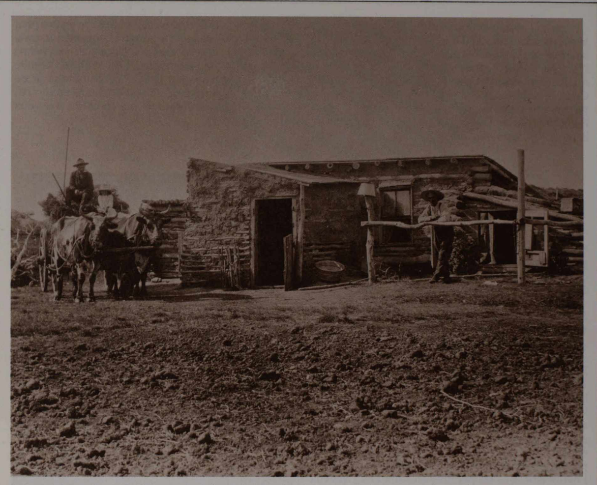
Early prairie immigrants built houses from the materials at hand. This sturdy home was made of sod.