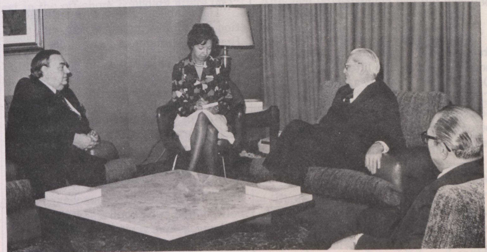
Secretary of State for External Affairs Donald C. Jamieson (left) is received by President Ernesto Geisel of Brazil, during a 15-day visit to Brazil, Peru

and Colombia in January. An interpreter sits between them and, nearest the camera, is Brazil's External Relations Minister, Azereda da Silveira.