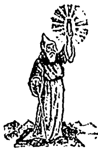
A CURE IN EVERY BOTTLE

SNELL'S BUSINESS COLLEGE, Windsor, N. S.