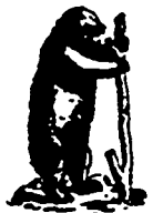
Sign of the Bear.

In the manufacturing of fine Furs to order we think that we can save you from 10 to 20 per cent. on ordinary prices, and at the same time guarantee a perfect fit and the latest style. We subscribe for the leading fur magazines, which enable us to supply our customers with the very newest European creations. All our furs manufactured on the premises.