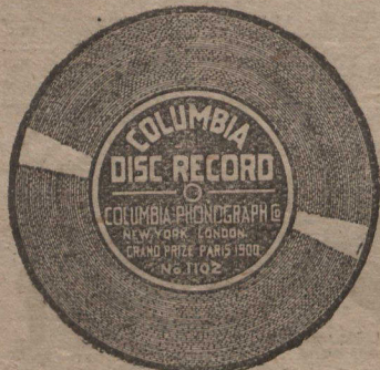
SEVEN-INCH COLUMBIA DISC RECORD.

Reproduces Speeches, Songs and Music, equal to a $30 machine. Don't throw your money away, but take advantage of our generous offer. In order to introduce Best Washing Blue in every County in Canada, we have decided to give away the "Grand" Talking Machines, Absolutely Free , for selling only 36 packages of Washing Blue at 10c per package. Don't send a Cent, We Trust You ; order to-day, and we will send you the Washing Blue by mail, postpaid; when sold send us our money, $3.60, and we will promptly ship you this machine complete, with 25 points, including a Coon Song . No charge for Boxing, Packing, etc. It reproduces songs, speeches, band music, etc., as loud and clear as a $30 machine, and can be used at all entertainments and concerts, in any size hall or room. The base is piano finished, with concert sound box, and 14-inch Metal Amplifying Horn.