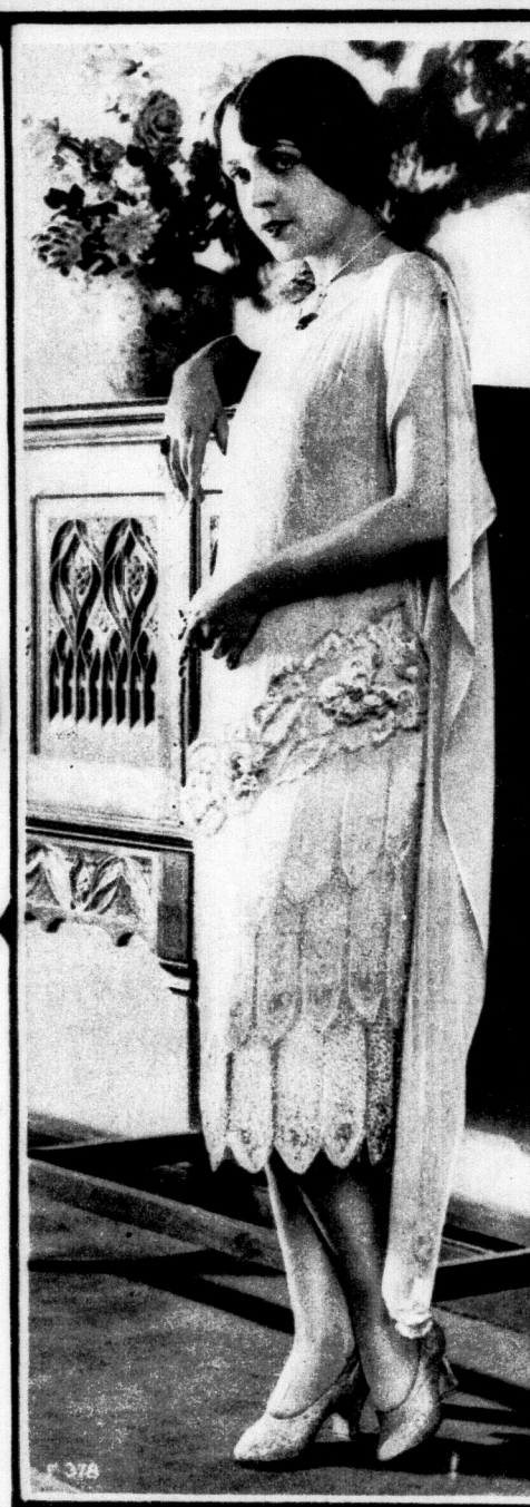
Gorgeous beadwork distinguishes this stunning dinner dress