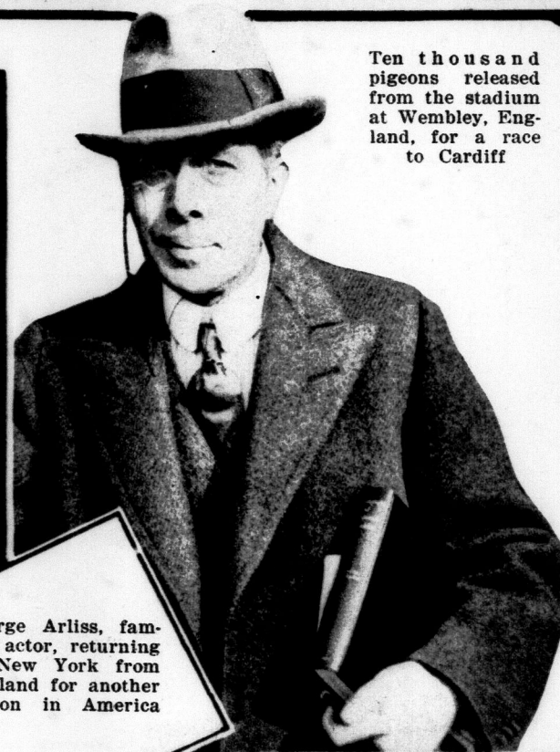
George Arliss, famous actor, returning to New York from England for another season in America