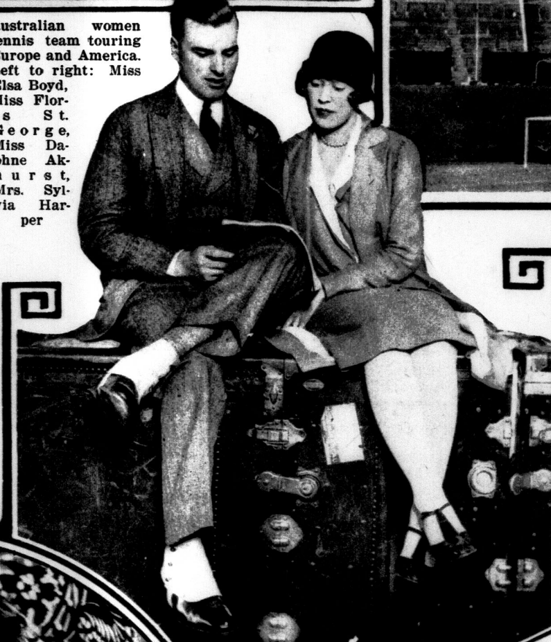
Captain Arthur Evans, British M.P., and his American wife, arriving for the interparliamentary meeting in Washington