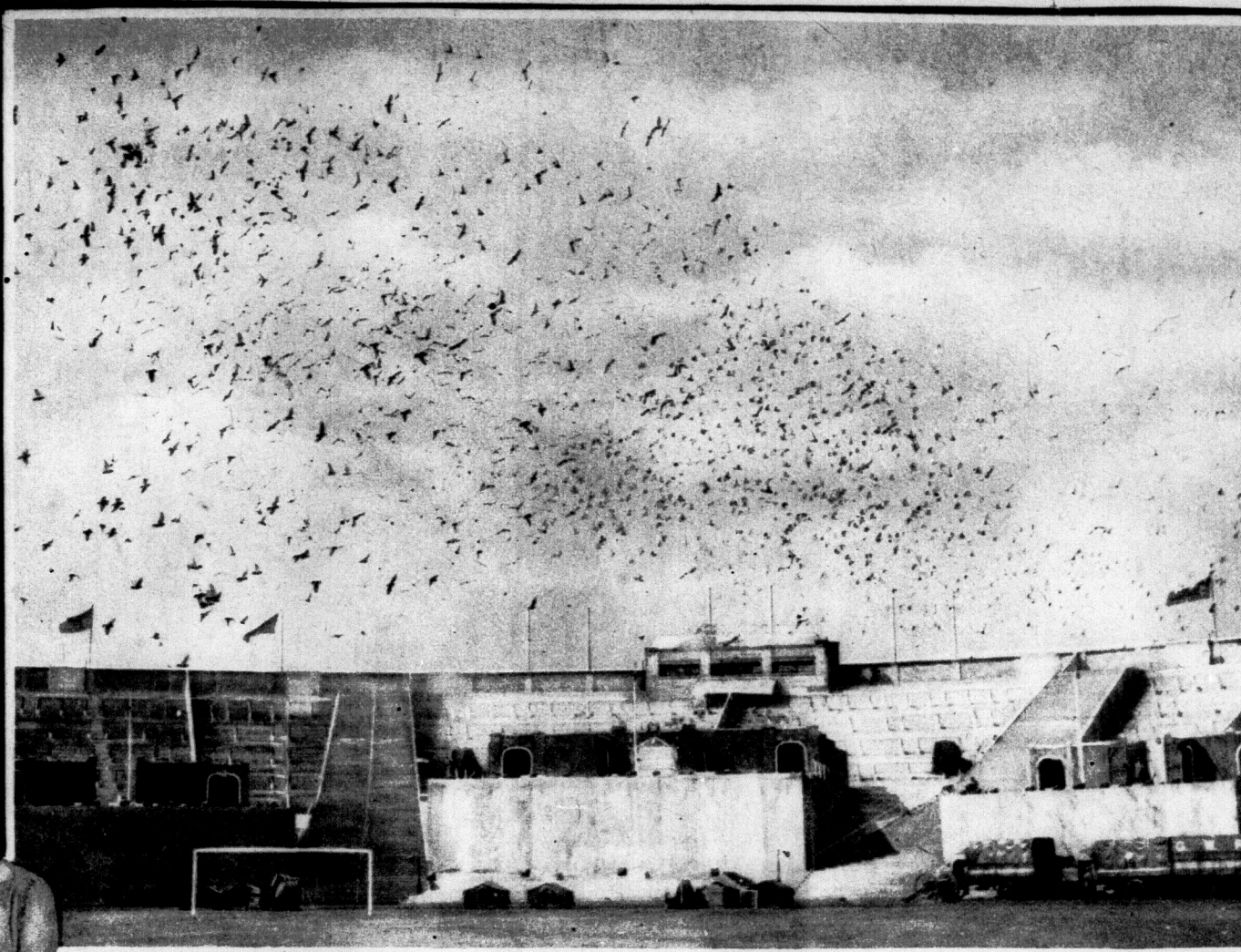
Ten thousand pigeons released from the stadium at Wembley, England, for a race to Cardiff