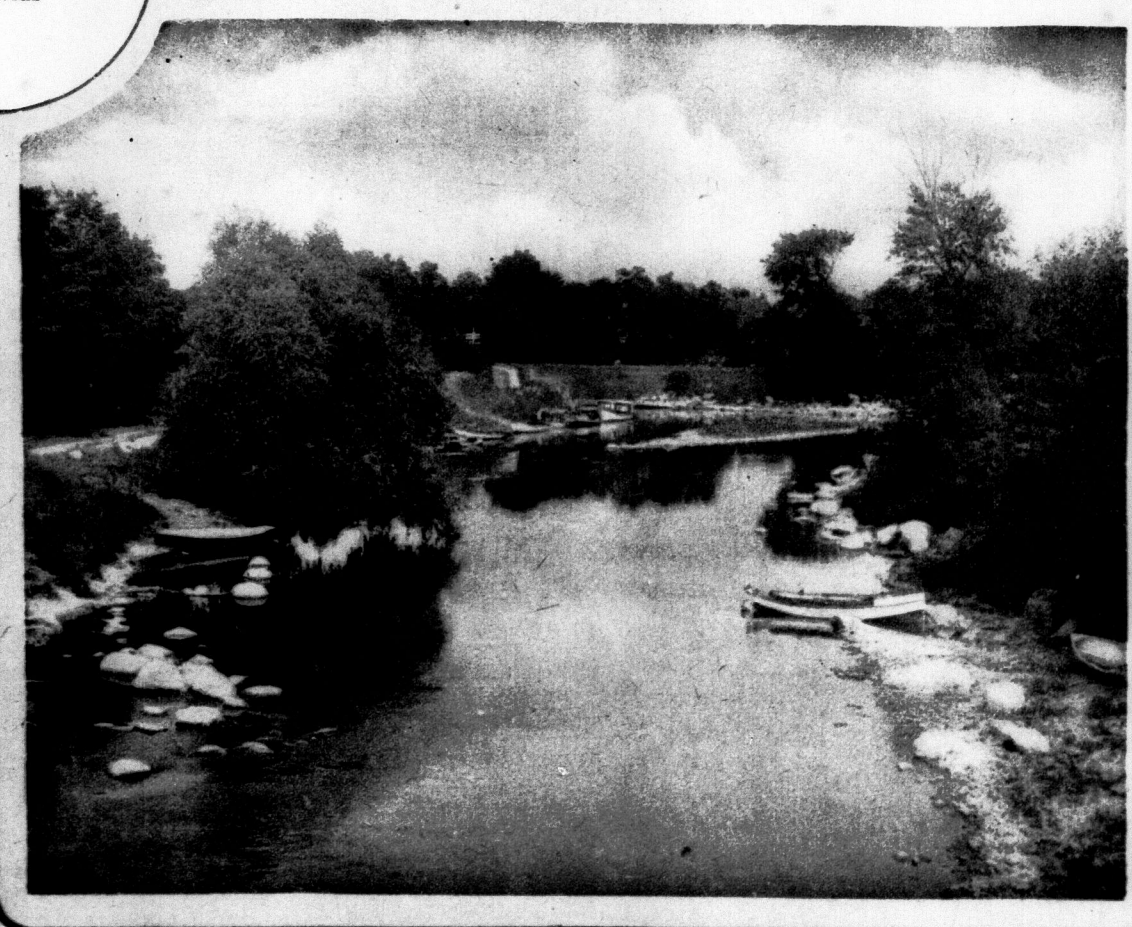
This stream running through Meaford, Ont., is used as a harbor for fishing boats