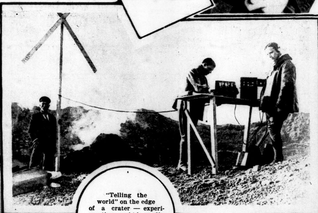
"Telling the world" on the edge of a crater — experimenting with radio telephony at Mt. Vesuvius