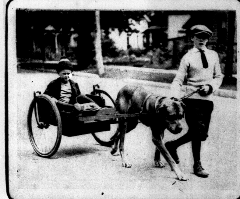
These St. Catharines lads are having a wonderful time training their Great Dane