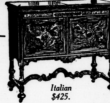
Italian $425. See this beautiful model in our window.

Most valuable pearls come from the Persian gulf. Pistol has been invented for shooting flies. Garlic is being used as a treatment for the cure of tuberculosis. World's largest salt shaft is said to be at Retsof, N. Y.