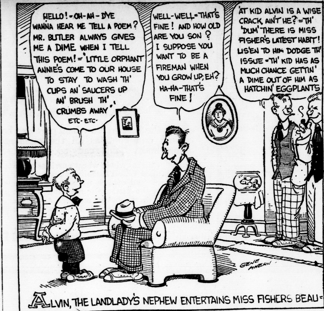
ALVIN, THE LANDLADY'S NEPHEW ENTERTAINS MISS FISHER'S BEAU.

did not attempt to conceal their satisfaction at the answers of Mr. King. "Why that opens up the whole question again in the new parliament," said one. "That letter should make Mackenzie King premier."