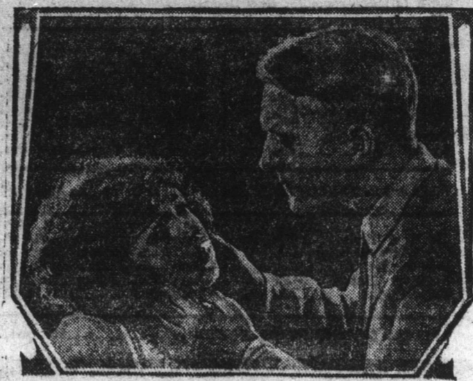
Colleen Moore and James Morrison in the Paramount Picture "The 9th Commandment," A. Q. Cosmopolitan Production.