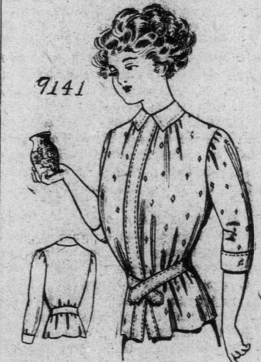
9141—A PRACTICAL SUGGESTION FOR A NEGLIGE.

Ladies' Dressing or House Sack. Dotted Challie in pink and white is here shown. The fronts are slightly full and finished with a box plait over the centre. The sleeve may be cut long or short, and are finished with a rolling cuff. The pattern is cut in six sizes: 32, 34, 36, 38, 40 and 42 inches bust measure. It requires 3 1/2 yards of 36 inch material for the 38 inch size.