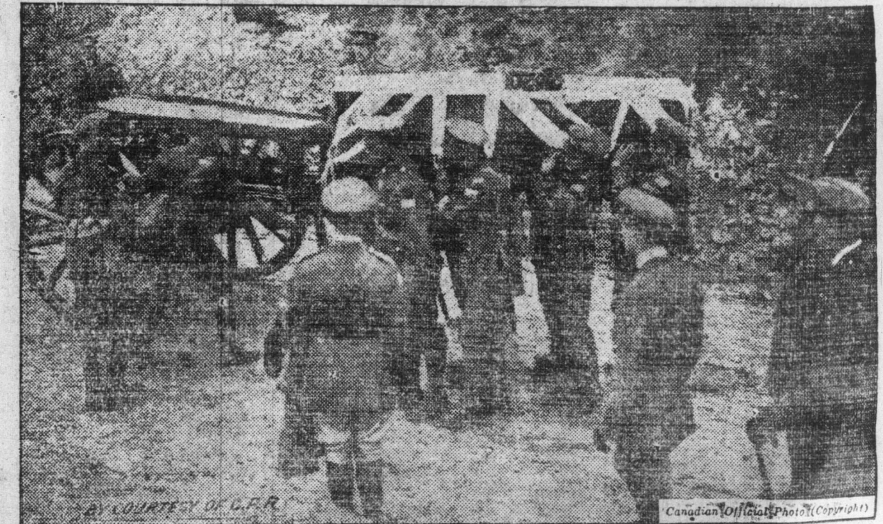
Funeral of General Lipsett near the lines. Taking the coffin from the gun carriage. H.R.H. the Prince of Wales following the coffin.

Funeral of General Lipsett Funeral of General Lipsett near the lines. Taking the coffin from the gun carriage. H.R.H. the Prince of Wales following the coffin.