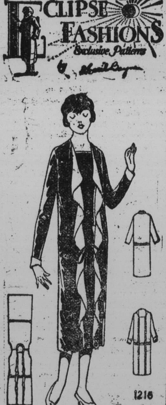
THE LONG-SLEEVED DATIN FROCK.

only the one fixture. In some bedrooms one well-shaded overhead light will do for general lighting, but to prevent shadows at the dressing table it is well to have side wall lights on either side and a