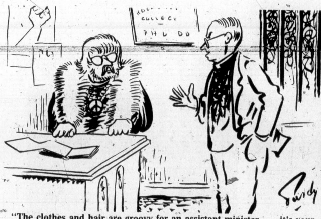
"The clothes and hair are groovy for an assistant minister... it's your 'unholier than thou' attitude that gets me!"