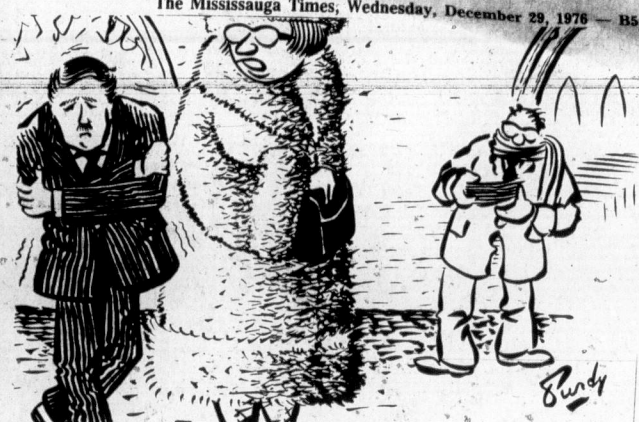
"Oh stop complaining... It's our Christian duty to keep the heat turned down."