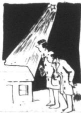
"THAT'LL BE A TOUGH ONE TO BEAT!"

DEC. 16: Christmas light decoration contest in Park Royal.