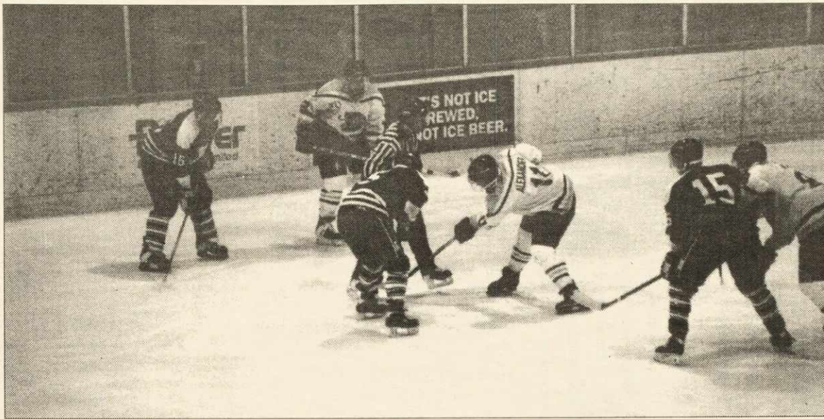
Tigers split pair of weekend games against Cape Breton and St. Francis-Xavier