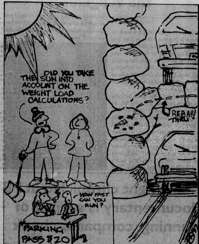
STUDENT MERGER: CIVIL ENGINEERING AND BUSINESS. Solving the campus parking problem.