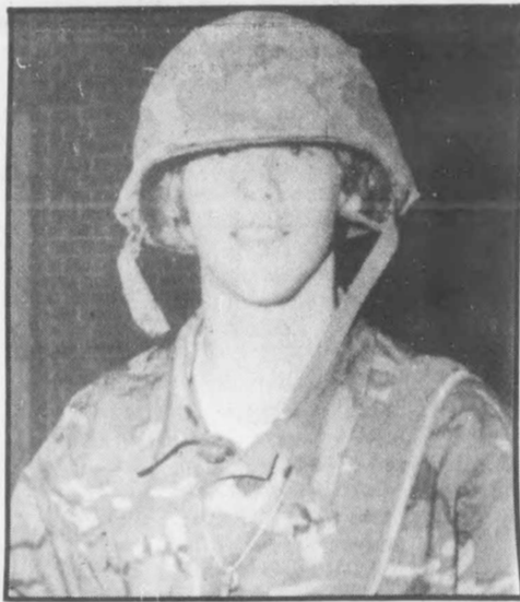
Gen. Klingon Stinger; C.F.B.

Should any science student wish to monitor the blast for his or her thesis please contact Director Korris for his permission.