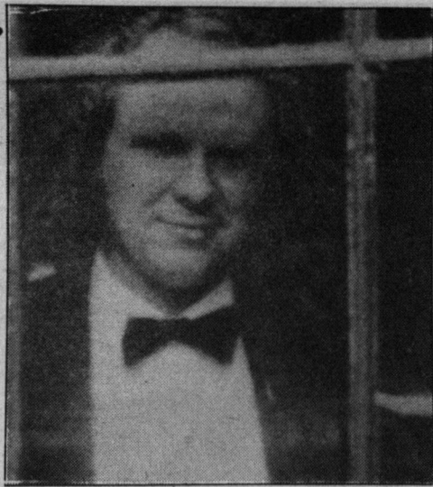
bp Nichol: Canadian poet dead at 44.

There isn't much fanfare for a writer who dies, especially a Canadian writer. After a memorial service held earlier this year for poet Gwendolyn MacEwen, the Festival of Authors at Harbourfront, Toronto (Oct. 14-22) announced a tribute