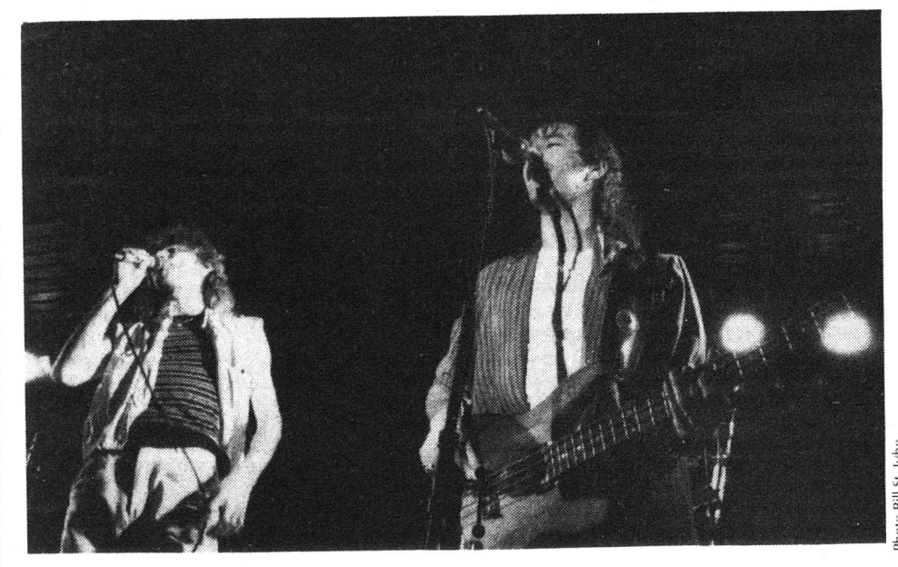
Generra: potential obscured by clone-like image

Generra shows potential as an outstanding band, but only if they can overcome a clonelike image and somewhat weak originals.