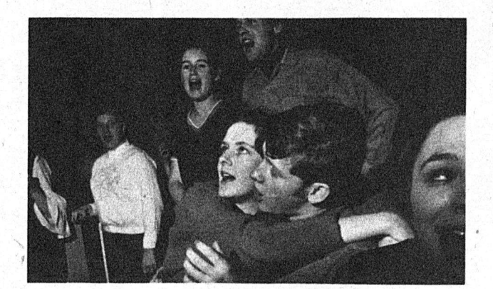
It's today . . . and the Jubilaires love it.

So if you're in town or on campus for Varsity Guest Weekend, don't miss the Jubilaires production of "Mame!" Hurry down to their box office in SUB and pick up your tickets right now.