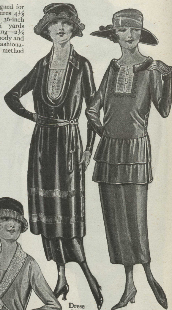
Dress 8483 25c

8483—Misses' Dress. Designed for 14 to 20 years. Size 16 requires 4½ yards 36-inch satin—¾ yard 36-inch white taffeta for vest—¾ yard caught-in fringe for trimming—2½ yards 36-inch lining for underbody and top of skirt. Fringe is a very fashionable trimming and the newest method of using it is illustrated here with the edge caught in so as to give the effect of insertion. The blouse is cut down in deep U-shaping disclosing a vest of white taffeta, and on the front-closing skirt is arranged a gathered tunic. Lower-edge width 1¼ yard.