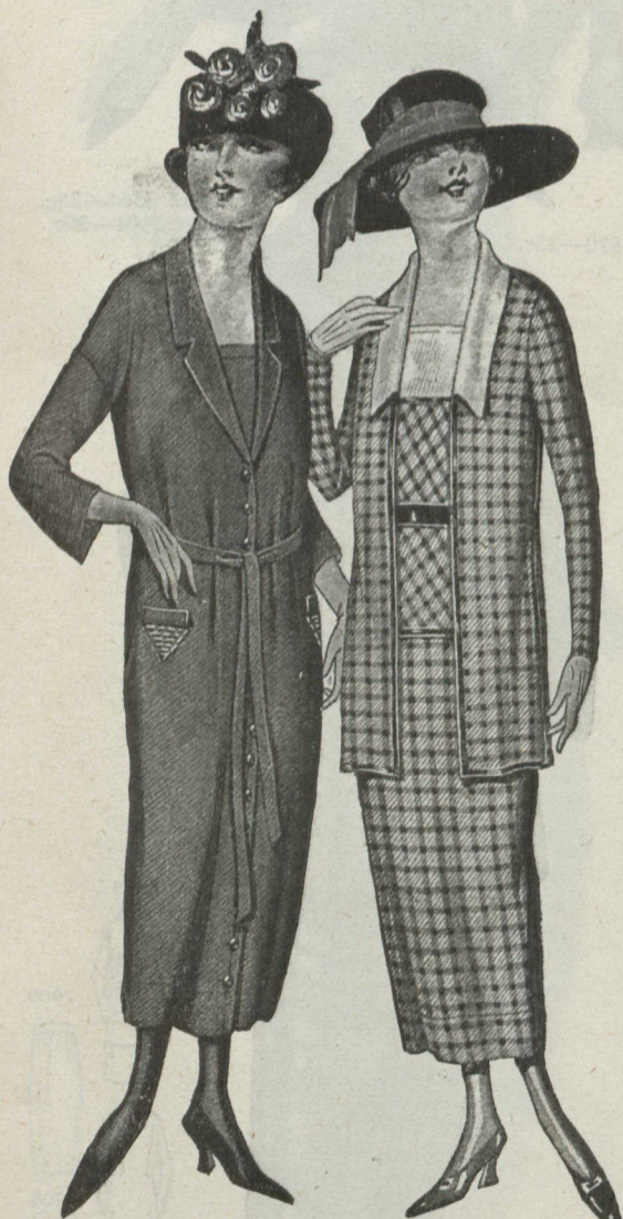
Dress 8434—25c. Embroidery 12473, blue or yellow—10c.