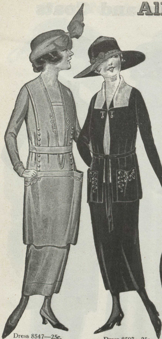
Dress 8547—25c. Braiding 11453, blue or yellow—20c.