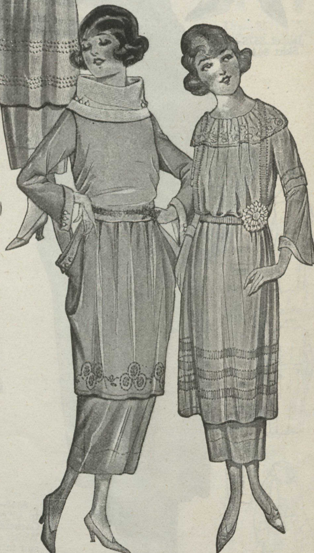
Dress 8513—25c. Embroidery 12445, blue or yellow—20c.

8511—Misses' Dress. Designed for 14 to 20 years. Size 16 requires 5¼ yards 36-inch tricolet—1¾ yard lace for collar—¾ yard 36-inch lining for underbody. One of the fashionable tie-around blouses forms part of this charming frock, the fronts of the blouse with extensions that make the girdle. Rows of jet nail-heads are applied to form the good-looking trimming, and over the long collar of tricolet is arranged one of heavy lace. The set into narrow armholes and fitting closely above the elbow, the sleeves widen out below elbow into bell-shaping with turn-back cuff sections on the inside. Width at lower edge about 1¼ yard.