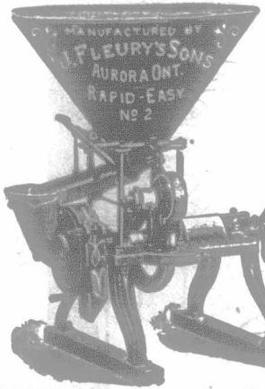
GOOD in QUALITY. The 'RAPID-EASY' GRINDER is certainly the PRER of its class.