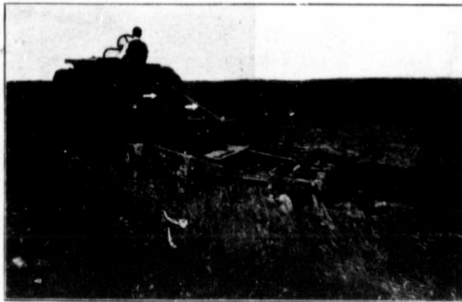
Scene Showing Power Lift Control referred to in "3"