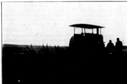
Plowing Outfit, Florence, S.D.