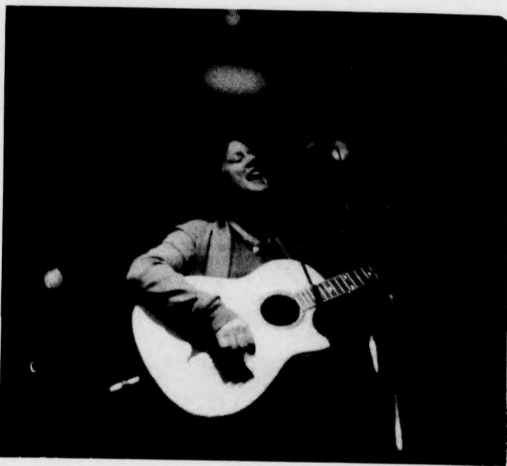
Sarah McLachlan's eighth return to Toronto in one year was recorded for an upcoming live LP to be released soon.

But the real treats were the altered song arrangements for the stage. Rather than recreate the stilled ambiance on disc, the band pumped songs like 'Into The Fire', 'Steaming' and 'Black' with hosed-up basslines and beats, and samples from 'Vogue,' C+C Music Factory, and Chic. And like pseudo-maenads at ritual, members of the audience rose from meditation to dance in the aisle and crowd the front.