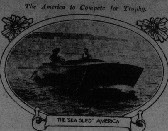
One of the competitors in the British International Motor Boat Trophy race will be the America, called by the motor boat enthusiasts the "sea sled." The "sea sled" made very good time, finishing among the first three and thus winning a place on the American team.