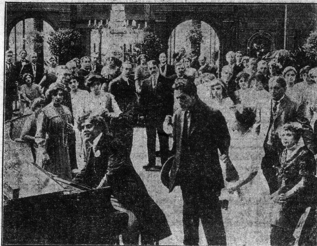
SCENE FROM THE STOLEN SYMPHONY, AT THE STRAND.