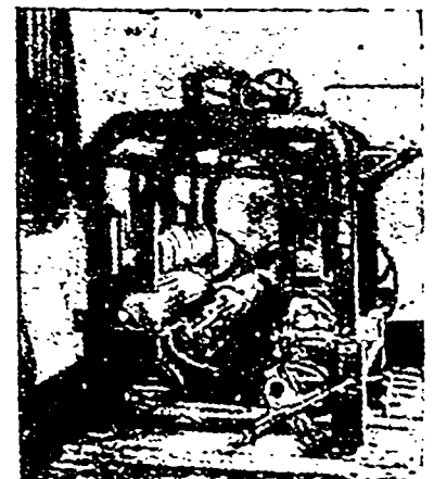
End View Showing Open End.

Write Us for Full Description and Prices