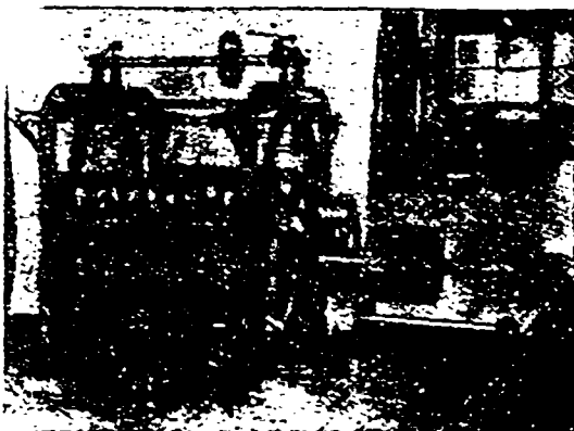
Feed Side View.

The knack of putting one's self in the buyer's place is essential to the writing of good advertisements.—Printer's Ink.