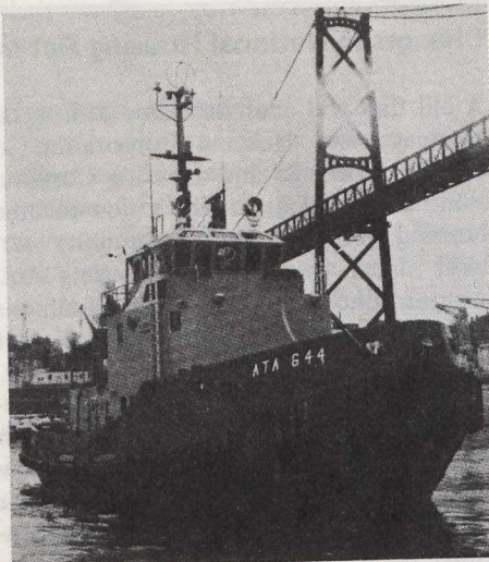
New harbour tug Glenside.

There have been a lot of changes in the CFAV fleet in the past few years. A new