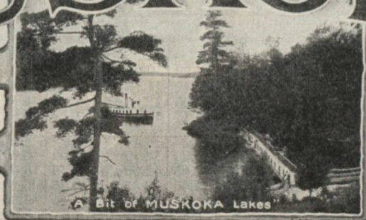
A Bit of MUSKOKA Lakes