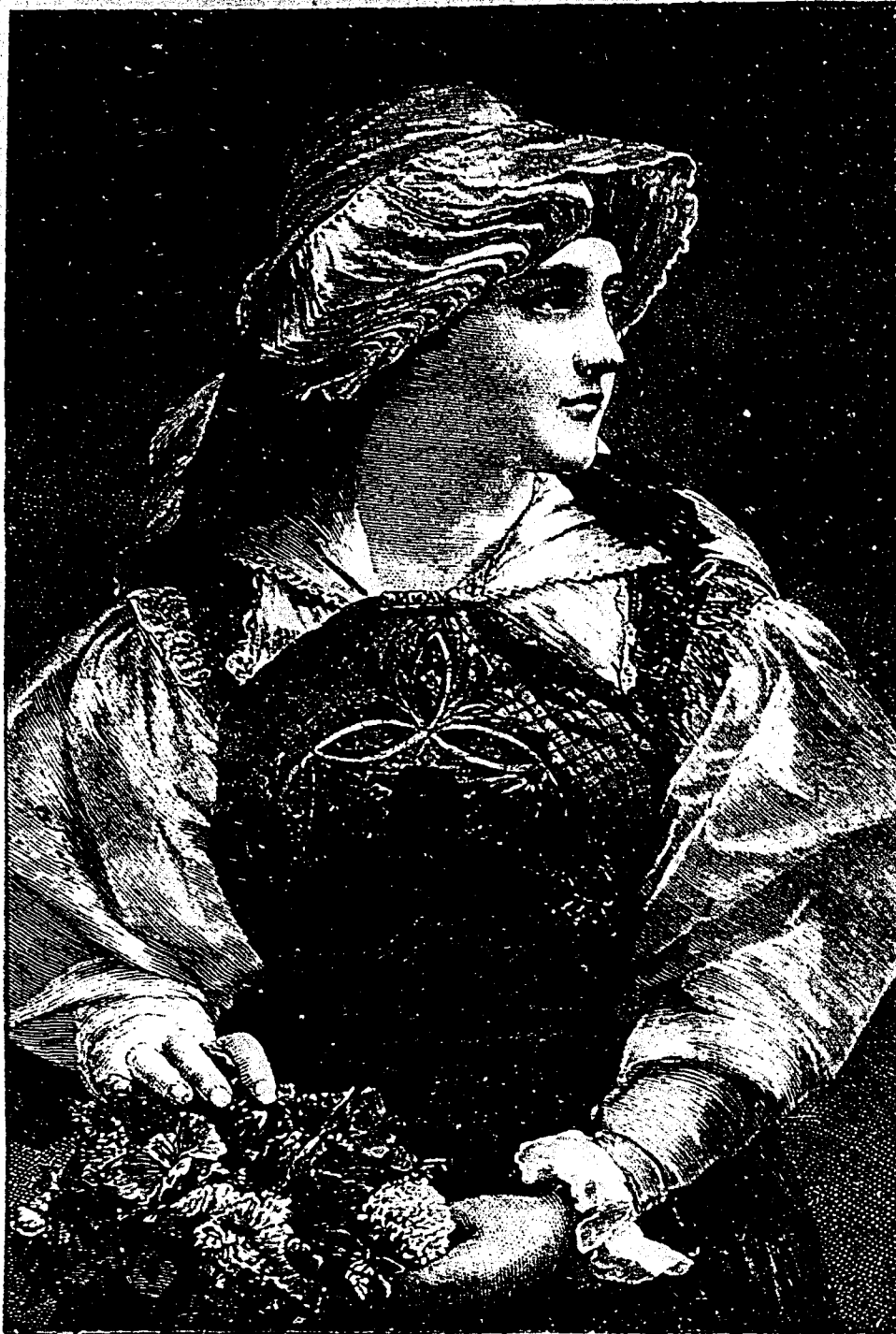
AUSTRIAN PEASANT GIRL.