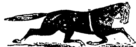
THE TURF EVENT OF THE YEAR.