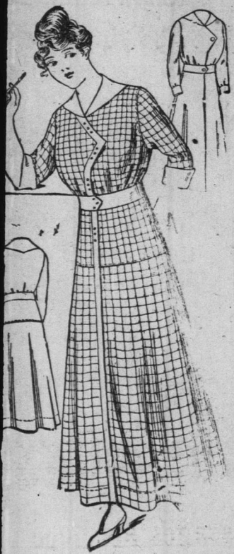
House Dress with or Without Sleeves, and with Sleeve in Either of Two Lengths.

A MOST ATTRACTIVE DRESS FOR HOUSE OR PORCH WEAR.