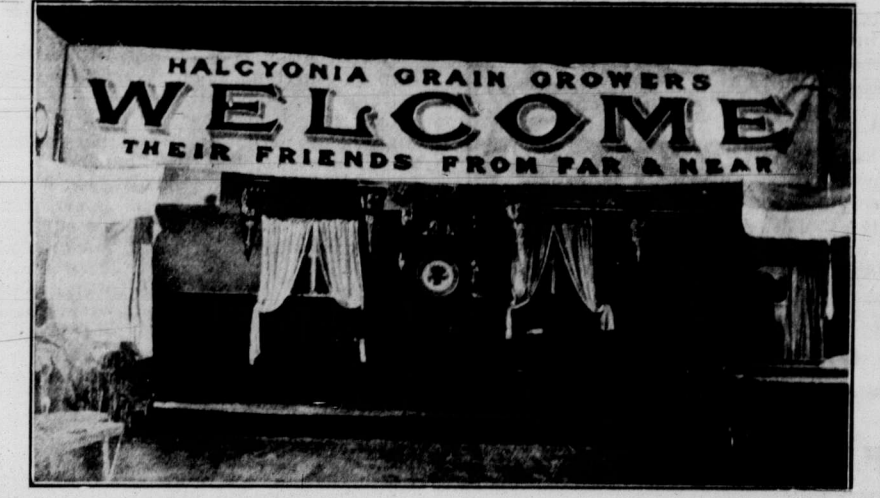
Halcyonia Schoolhouse prepared for Grain Growers' annual concert and suppe

portation problems." Governing and administrating the affairs of a country is, after all, a business proposition, and a country, like a business, runs more smoothly when the partners sink their differences and work together than when they disagree and waste their energies in petty civil wars.