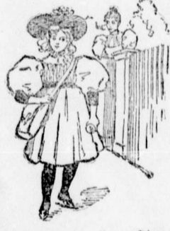
"Now Entirely Free From Disease."

Having learned that the little one had been fully restored to health by the use of Dr. Williams' Pink Pills, a correspondent of the Journal called