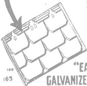
"EASTLAKE" GALVANIZED SHINGLE

Metallic Roofing Co. Limited Toronto Winnipeg