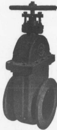
Flanged End Gate Valve with Hard-Wheel.