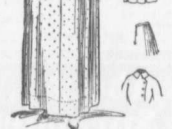
SURPRISE WAIST, 6913

This pattern is cut in sizes 34, 36, 38, 40 and 42 in.