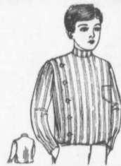
BOY'S RUSSIAN BLOUSE, 6918

Of the many disorderly things in the home the work box is usually the most so. I decided mine should be in better order. I took a lath 24 inches long and placed nails with small heads about every inch along the entire length. I painted this white. I put three long nails in the wall near the sewing machine, placing the lath on these, which I also painted white. A spool was slipped over each nail