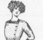
HOUSE GOWN WITH FOUR GORED SKIRT, 6911

The pattern is cut in sizes of 6, 8, 10 and 15 years.