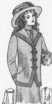
GIRL'S COAT 6966

Realizing the great interest that our readers take in the new spring styles, we shall only give additional space to the pattern department of Farm and Dairy for this week. Look over the illustrations in the fashion department and send your orders early. If you do not see the style illustrated that you would like, advise us, and we will do our best to get it for you. Write all prices plainly, giving name and address, size and number of pattern desired. Address, Pattern Dept., Farm and Dairy, Peterboro, Ont.