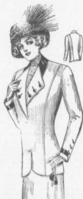
SINGLE BREASTED COAT, 6912

The coat that is made simply, with loose fronts, is always becoming to the younger girls and is greatly in vogue. This one has slightly cut-away fronts that are smart. For a girl of 12 years of age, will be required 4 yards of material 27 inches wide, 3 yards 36 or 3 yards 44 inches wide, with 4½ yards of braid. This pattern is cut in sizes for girls of 10, 12 and 14 years of age.