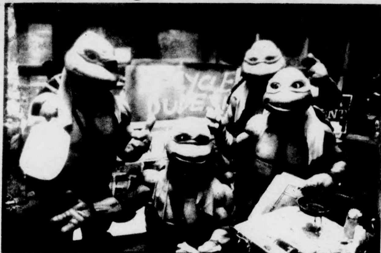
Michealangelo, Leonardo, Raphael and Donatello, the Teenage Mutant Ninja Turtles (not the painters), are back in The Secret of the Ooze . Just when you thought you wouldn't have to hear anybody scream, "Cowabunga..."

This time the turtles are trying to find The Secret of Ooze . You know, the mutagenic green gunk which made Michealangelo, Leonardo, Raphael, Donatello, and Master Splinter what they are today (a hugely successful merchandising campaign). The movie is subtitled The Secret of Ooze , which isn't quite true. It's more the rescue of the ooze but we'll get to that in a moment.