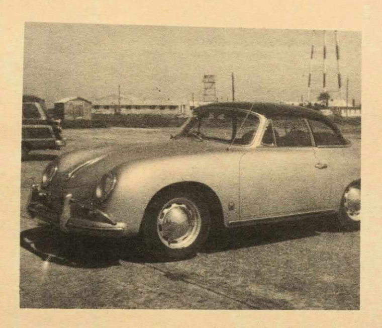
"Hail to thee, blithe spirit".

The driver, too, is usually a person with markedly higher intelligence, more education and a better income than the driver of more mundane machinery. However, it must be conceeded that this picture is not all and light. A number of criticism of these vehicles, partly it could be said stemming from the fact that they are imported, have been hung on the sports car.