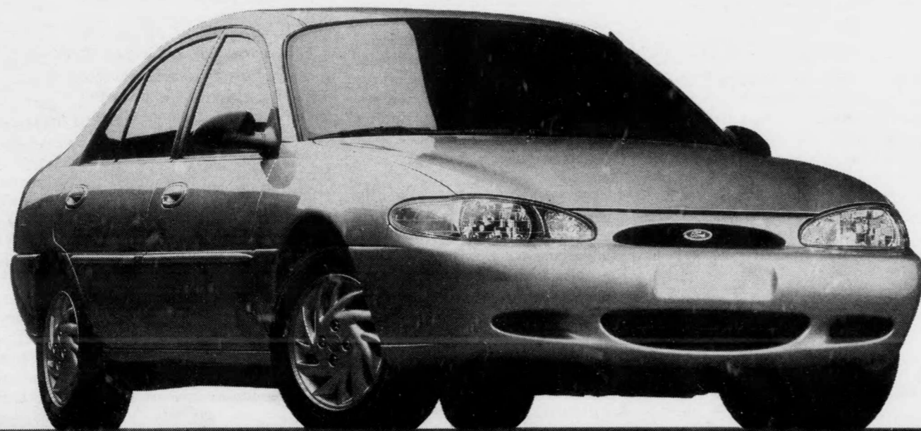
The All-New 1997 Escort

JUST FOR graduating we'll give you $750 TO HIT THE ROAD!