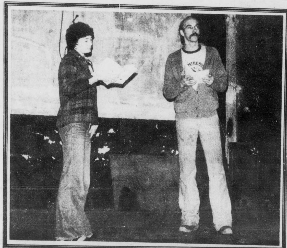
Performed by the UNB Drama Society