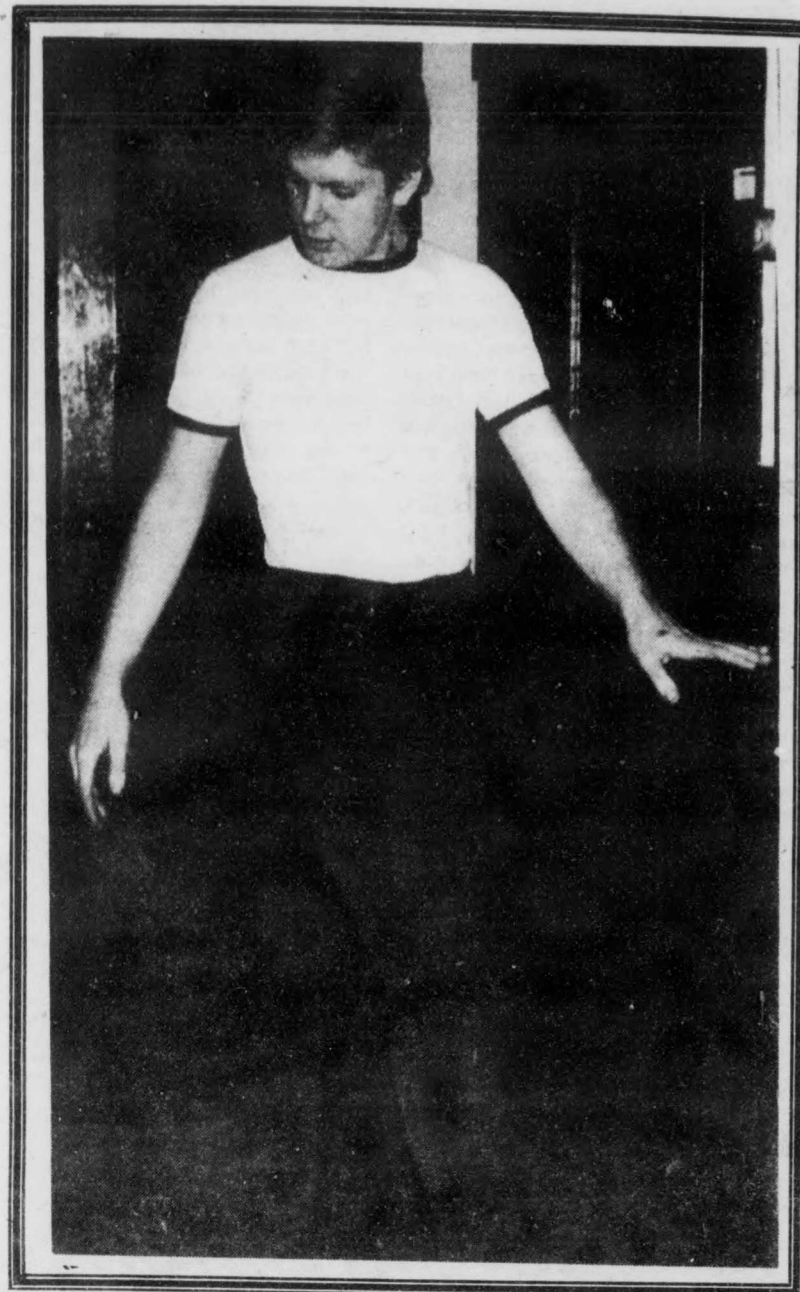
A Play by Sandy Wilson