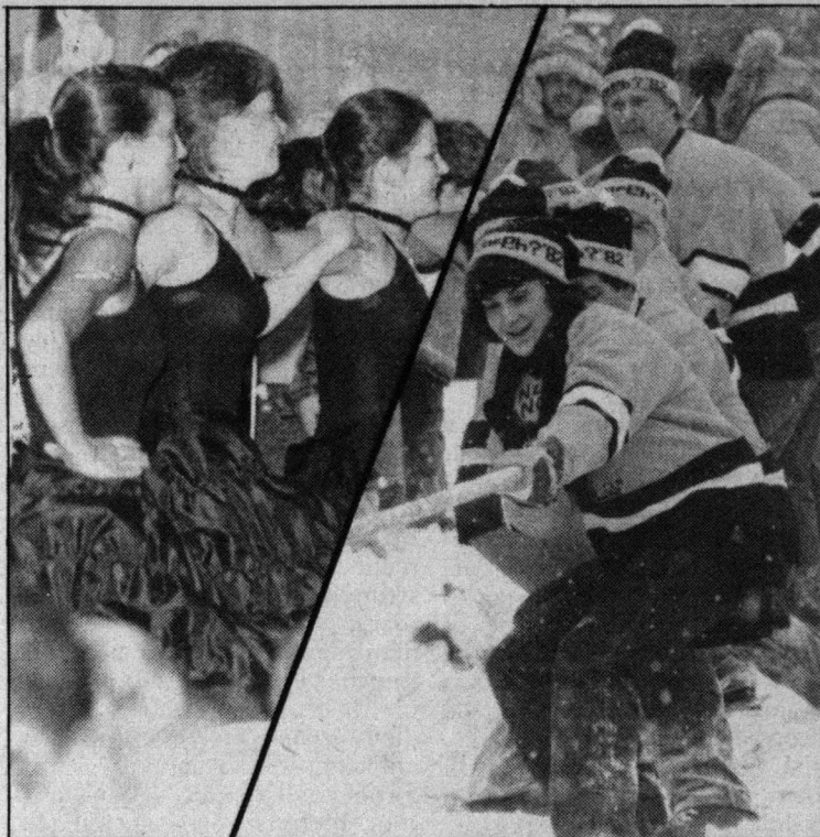
Taffeta frills versus Mackenzie brother toques at Engineering week.