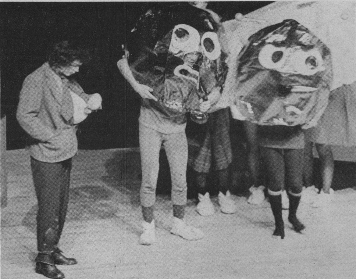
Ah, yes, the Med Show; another of our fine traditions