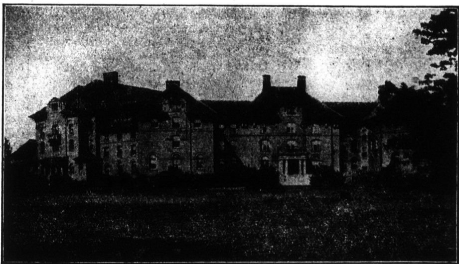
MacDonald College, Women's Residence

Your table drink will never bother nerves or sleep if you quit coffee and drink