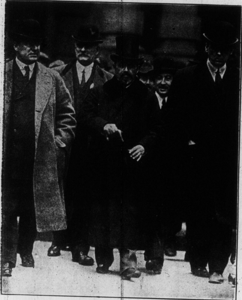
GEN. CIPRIENO CASTRO, EX-VENEZUELAN DICTATOR, BEING DETAINED AT ELLIS ISLAND, AWAITING PERMISSION TO ENTER THE UNITED STATES.