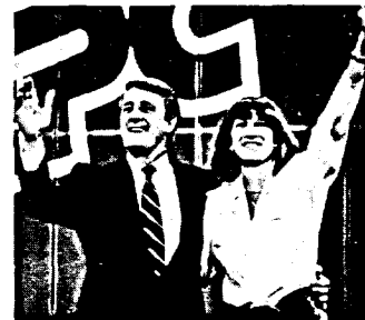
Brian and Mila Mulroney after election win.

Mul-ROO-ney or Mul-ROH-ney? Which is it? He seems to answer to both. It turns out that the English pronunciation is the former, whereas the French pronunciation is the latter. Which does he prefer? He's far too wise to toy with a question like that.