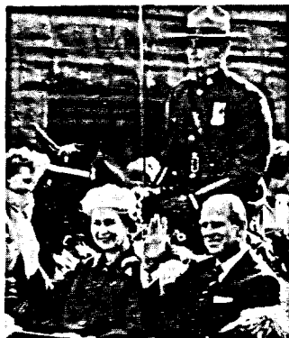
Queen Elizabeth and Prince Philip.

Talking appliances. Inglis has had a talking washing machine on the market for a few years and Whirlpool, its U.S. parent, has now developed a talking refrigerator. (Don't leave its door open, or you will quickly hear from it ... or her ... or him.) General Electric plans to introduce a computer system that will enable people to operate all their electrical appliances by remote control. All you need is the Home Minder which can be attached to any type of TV and whether you are at the office or abroad, your lights, coffee pot or whatever will do what you want them to do. Microwave