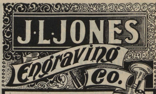
PHOTO & WOOD ~ ~ ENGRAVING ~ ~ AND ELECTROTYPING, FOR ALL ADVERTISING PURPOSES. ~

HEAD OFFICES: British Empire Building, Montreal Temple Building, - Toronto Agents Wanted