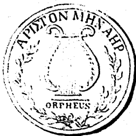
ANCIENT COINS FOUND IN DIGBY, N.S.