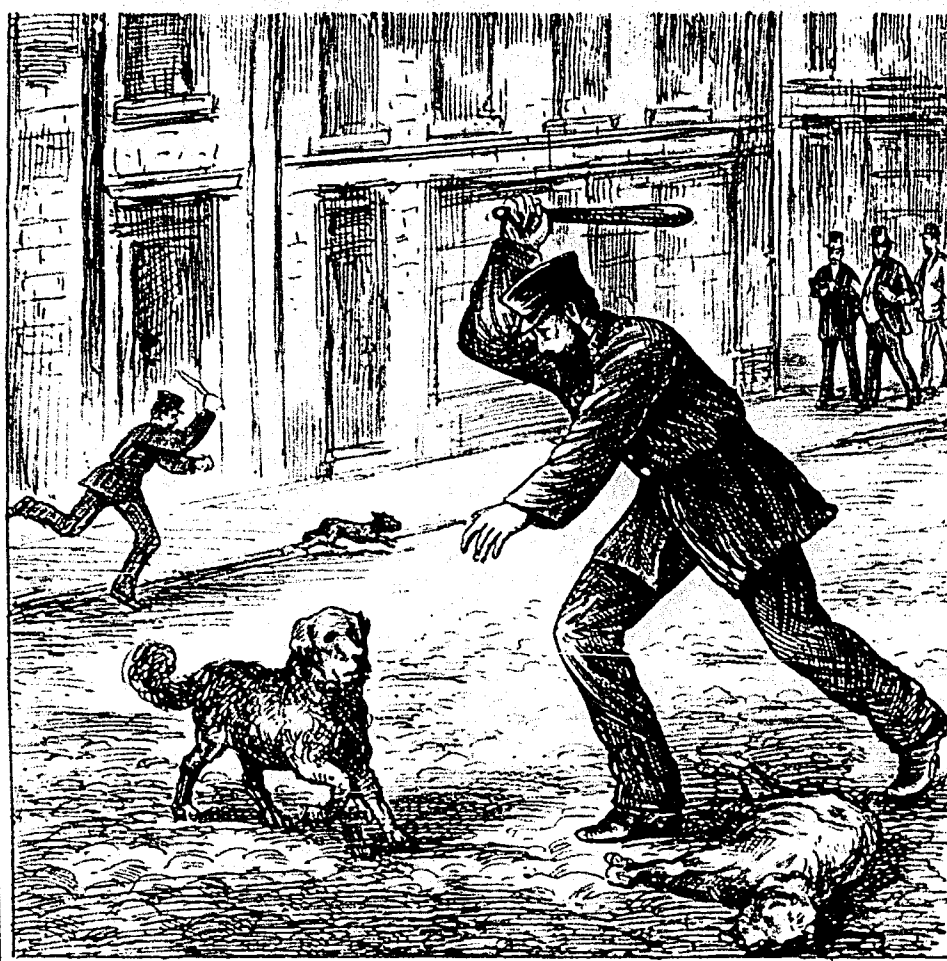
THE DOG DAYS.

D. MORRICE & CO., Ice Dealers, 24 VICTORIA SQUARE. Prompt Delivery and Pure Ice.