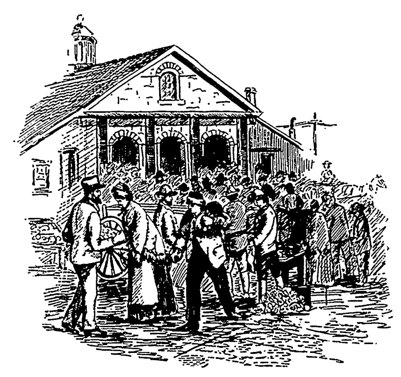
THE MARKET, WITH ITS STRANGE SIGHTS AND QUAINTLY-DRESSED HABITANT FARMERS.