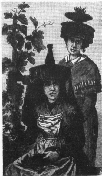
PEASANT WOMEN OF MACON.