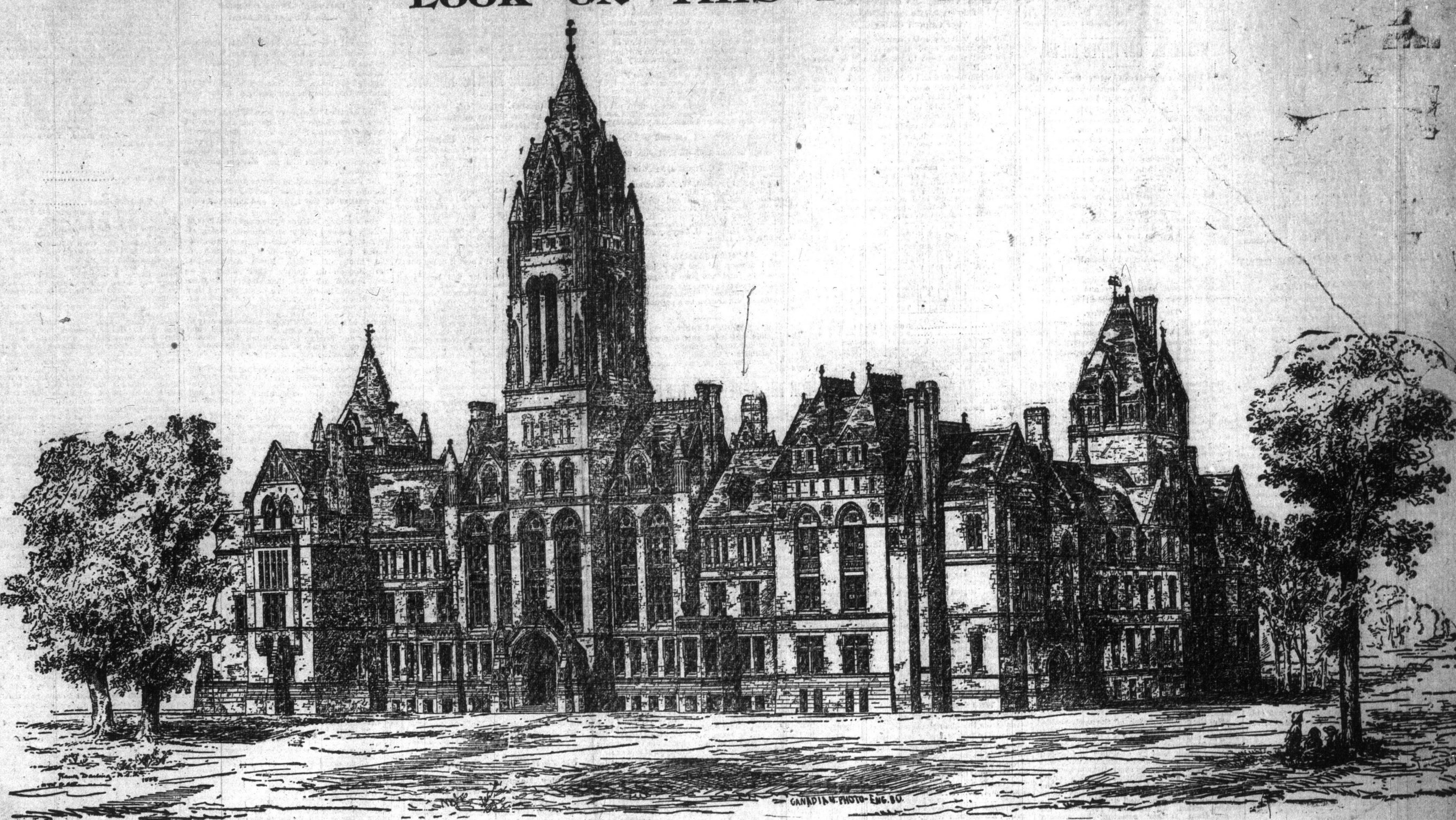
by Darling & Curry-Thrown Out Plans of the Proposed New Parliament Buildings as